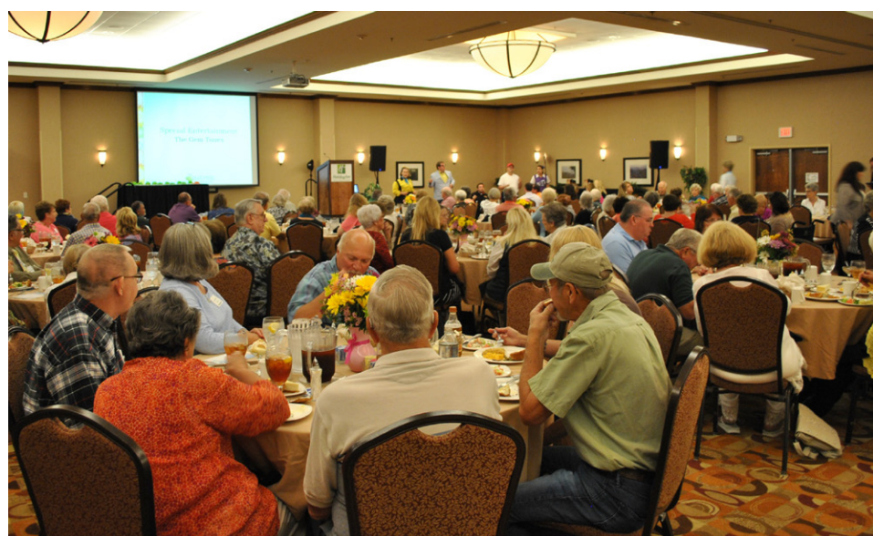
More than 120 volunteers and guests enjoyed luncheon entertainment by Dollywood's Gem Tones.